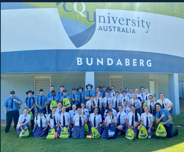
A great experience for our Year 12's

Any students who may have missed the Year 12 Experience Day may like to attend the CQU Bundaberg Open Day on Thursday, 11 August from 4-6pm to discover all the options CQU has to offer. Register here to attend so you can stay up to date about the event, your course of interest and upcoming application. You will also automatically be entered into the prize draw to win some great prizes when you register.