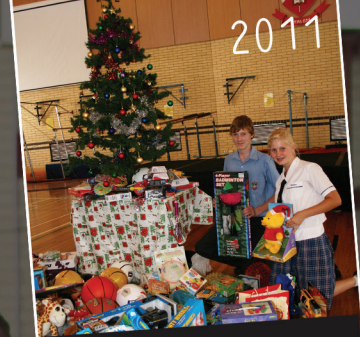
2011 Giving Tree