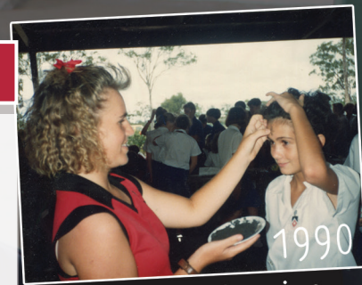
Ministry & Service